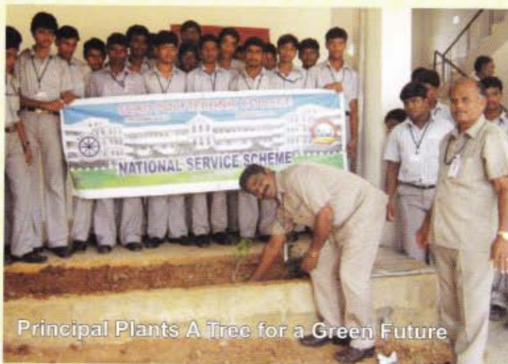
Principal Plants A Tree for a Green Future