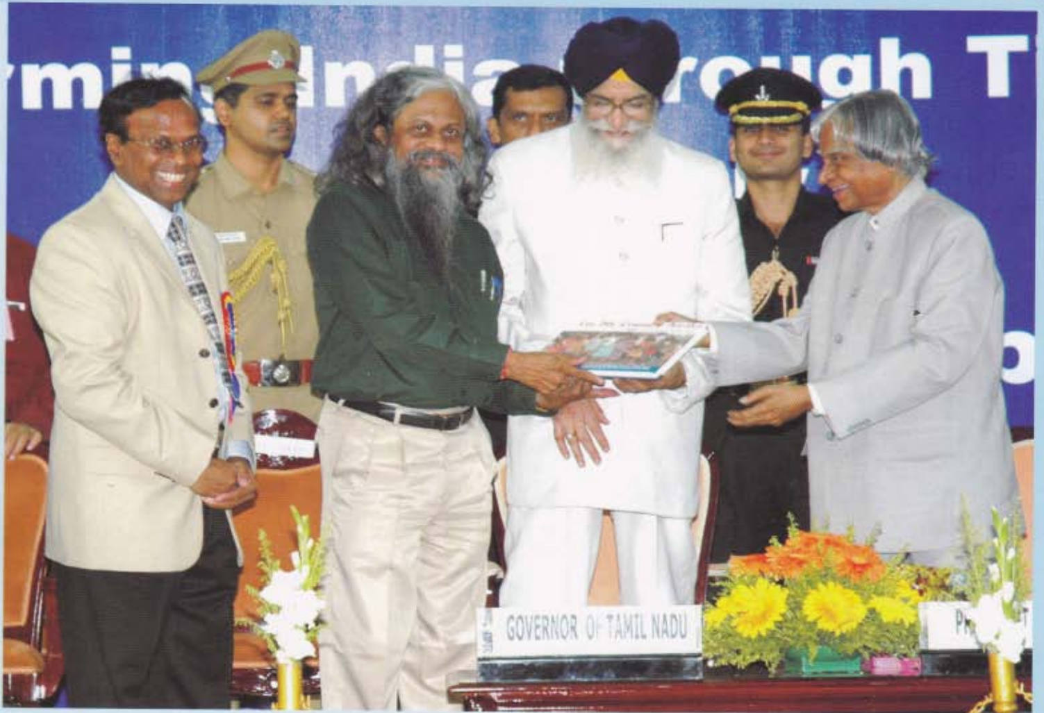
Former President of India in Our Campus