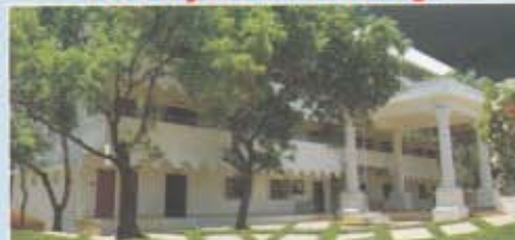
SCAD College of Education