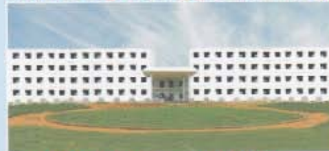
SCAD Engineering College