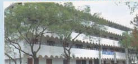
SCAD Community College