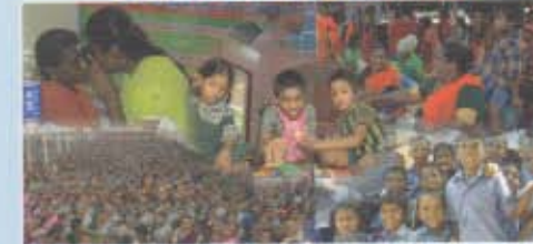
SCAD Rural Development Programmes

KALAKAD ROAD, CHERANMAHADEVI, TIRUNELVELI DISTRICT Ph : 04634 - 265156, 260216