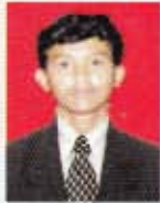
ASANBARUK TVS AUTOLEC