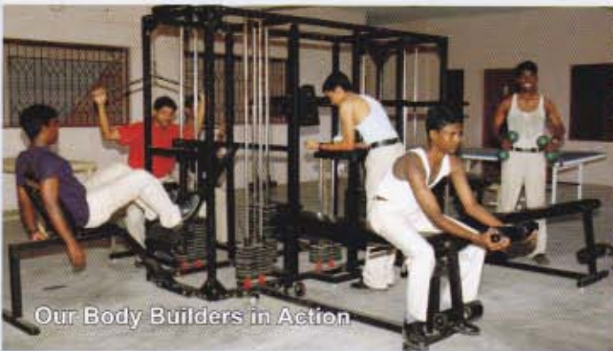
Our Body Builders in Action

Canteen caters all types of snacks and delicious food items for refreshment, facilitated with Photocopying machine and STD Booth.