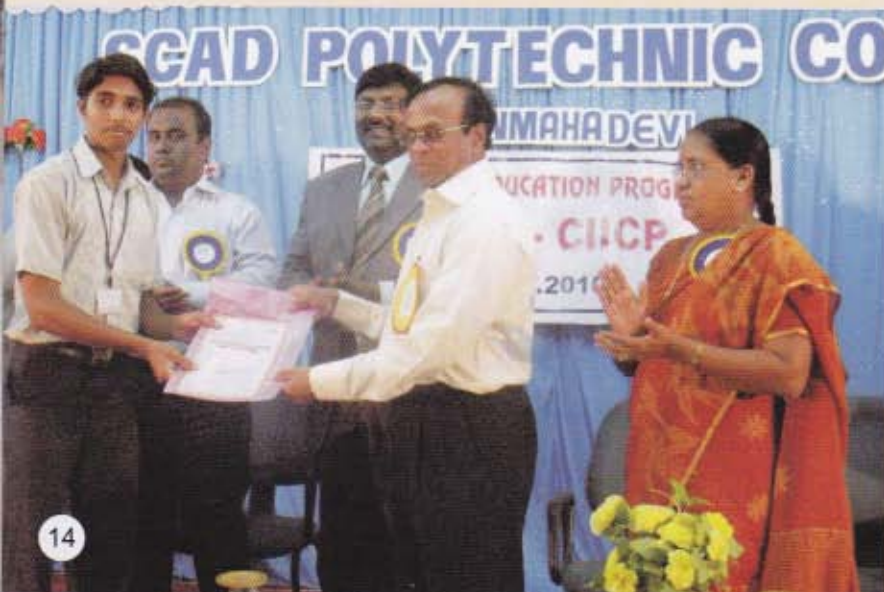
SPCU- CIICP Programme Chairman Distributes the Certificate to 4 Students