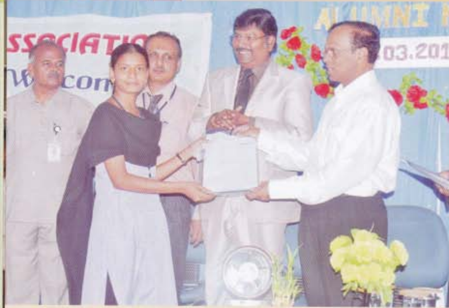
Chairman Distributes The Placement Order From HCL INFO SYSTEM