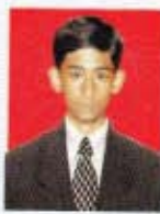
ASANBARUK TVS AUTOLEC