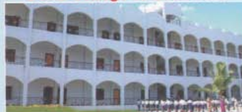
Good Shepherd Model School