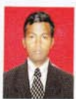
THIRU MALAI BRAKES INDIA