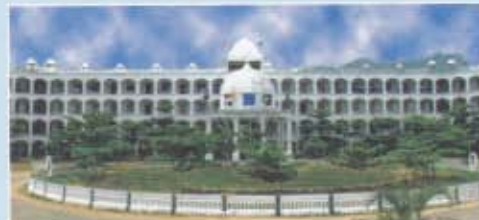
SCAD College of Engg. & Technology