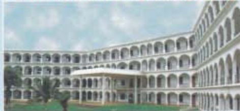
FX Polytechnic College