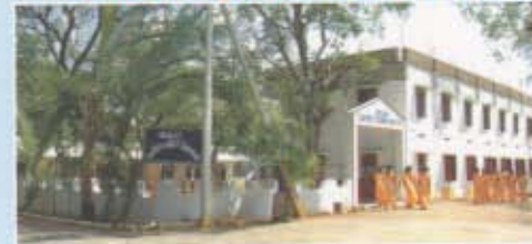
SCAD Teacher Training Institute