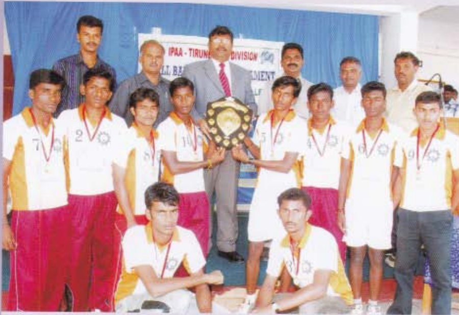
IPAA BALL BADMINTON Tournament