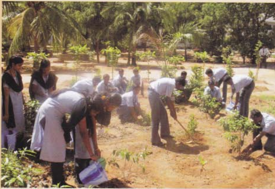
NSS Volunteers making The Campus ECO-Friendly