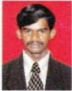
ANBUROSE TVS AUTOLEC