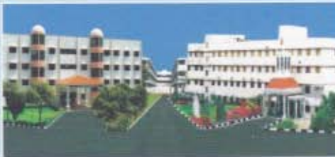
Francis Xavier Engineering College