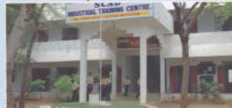
SCAD ITI - Cherenmahadevi