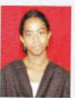
PUVANA.N HVL INFO