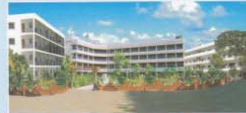
St. Xavier's Matric. Hr. Sec. School