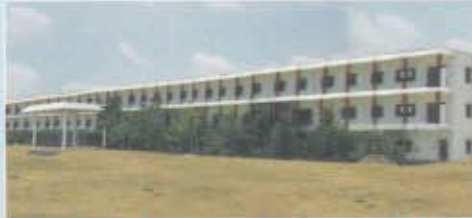
St. Mother Theresa Engineering College