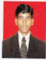
ANBUROSE TVS AUTOLEC