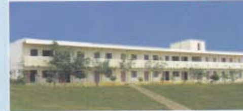
SCAD ITI - Vagaikulam