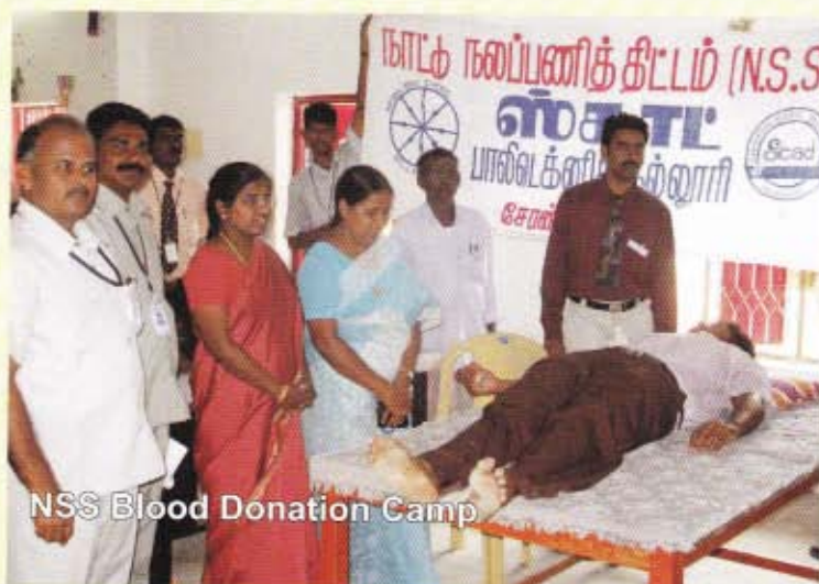
NSS Blood Donation Camp

All disciplines have their own Associations and the Associations organize Workshops / Seminars / Symposium etc at State Level periodically.