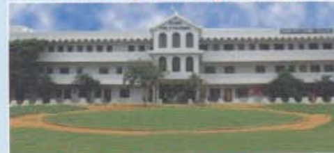
SCAD Polytechnic College